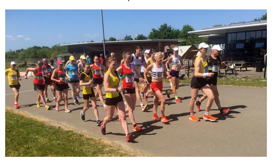
The Start

VAC was pleased to host the eighth running of this open event at Cyclopark, Gravesend, a dedicated cycle circuit with many gradients and bends, which has hosted Olympic BMX champion Beth